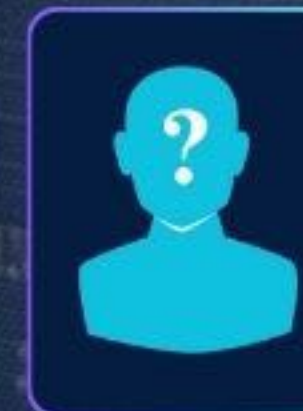
Could this be you?

Lead AI, Machine Learning & Algorithms Engineer