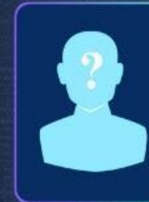
Could this be you?

Lead AI, Machine Learning & Algorithms Engineer